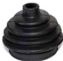
Molded Rubber Parts