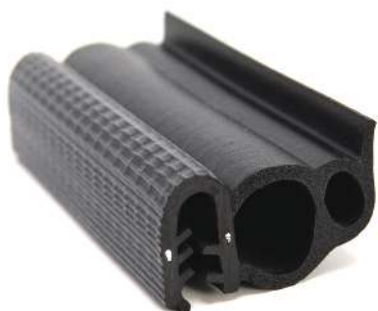
Bulb Trim Seals