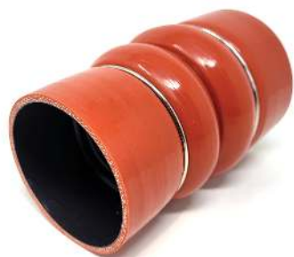
Silicone & EPDM Connectors