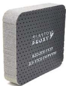
Insulation (Thermal & Acoustic)